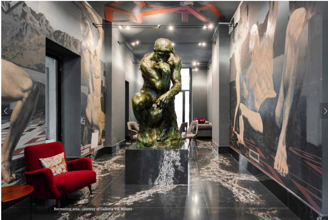
Recreation area